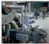
Super Spinner 伺服自由机械手