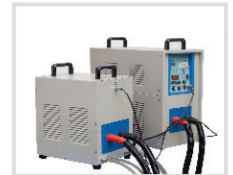
High frequency heating machine 高频加热机