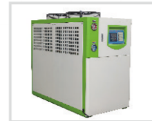
Water cooler 冷水机